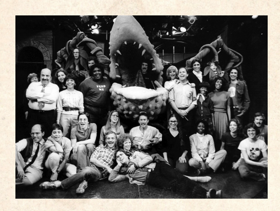
The original 1982 production