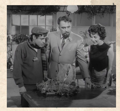
The original film